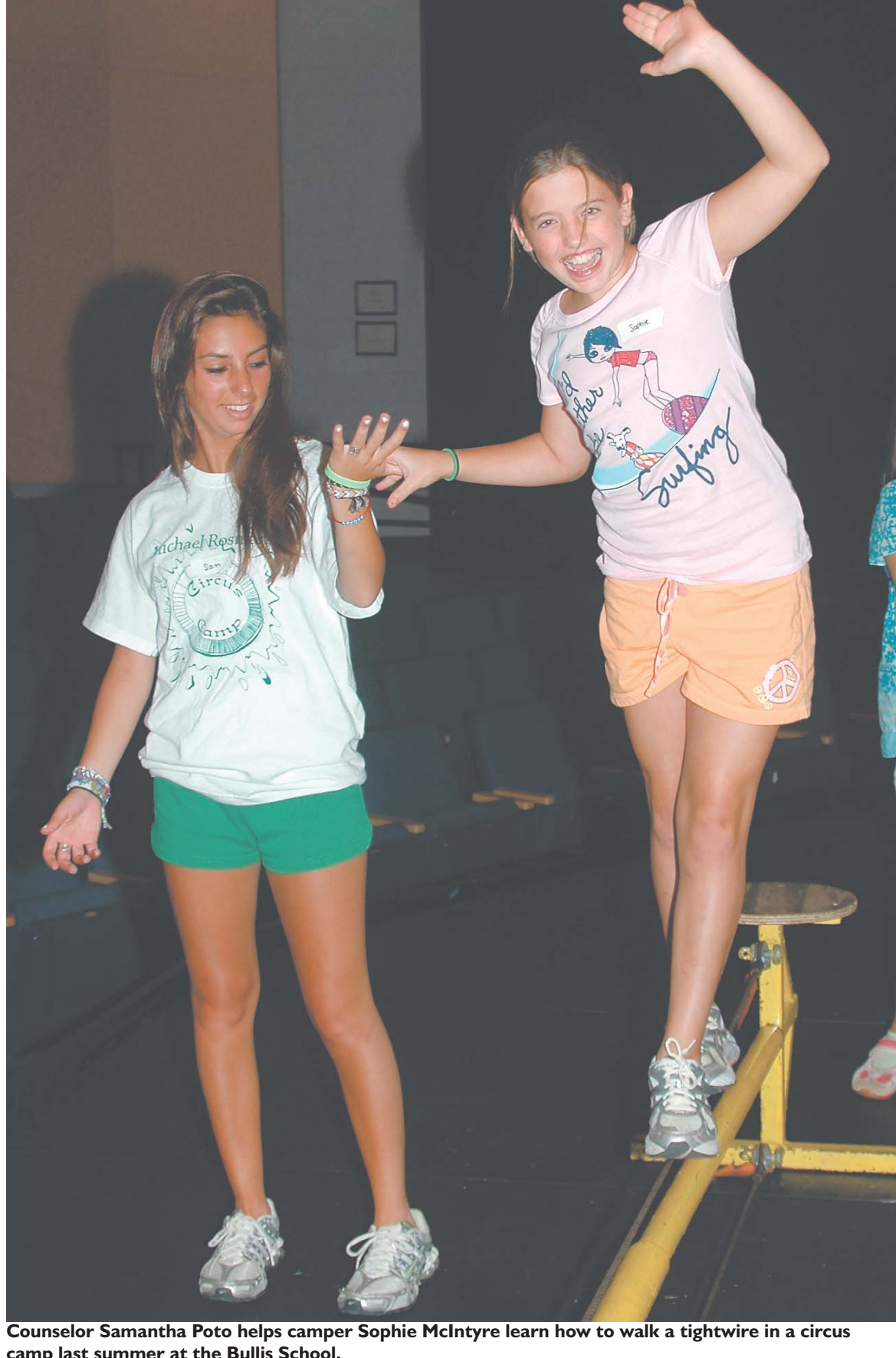
camp last summer at the Bullis School.